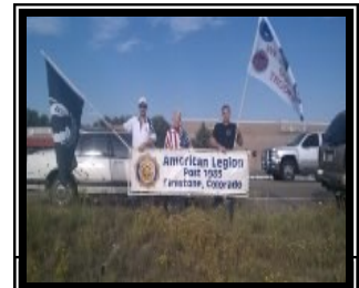
Honor Flight—September, 2014