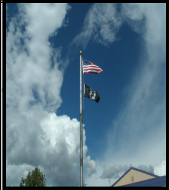
Land of the Free because of the Brave!!

May 1st—May Day / Honor Flight-8:30 I25 Frontage Rd. May 5—General Meetings—7 PM May 6—Auxiliary Fish Fry—6 PM May 13—Legion Steak Night-6 PM; Karaoke—7 PM May 20—Legion Riders Dinner—6 PM May 21—Spring Convention- Loveland May 27—SAL Dinner—6 PM May 30—Memorial Day Services and Luncheon : 12 noon