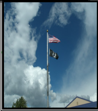
Land of the Free because of the Brave!!

Sept. 1—General Meetings—7 PM Sept. 2 —Auxiliary Fish Fry—6 PM Sept.5—Labor Day Sept. 9—Legion Steak Night 6 PM; Karaoke - 7 PM Sept. 10—Flag Retirement 6 PM Sept. 11—Honor Flight @ I25 Frontage Road 8 AM Sept. 11—18—Vietnam Traveling Wall and Week of Remembrance—Dacono, Furniture Row Sept. 14—Riders Meeting-7 PM Sept. 16—Riders Dinner—6 PM Sept. 23—SAL Dinner 6 PM Sept. 30-FND - 6 PM Broncos P/S - 9-1 VS Arizona Cardinals at Arizona—7:30PM