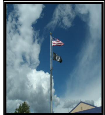
Land of the Free because of the Brave

Thanks to all that helped in the leveling and temporary surfacing of the parking lot and also to those that stripped, sealed, waxed and polished the hall floor. Both look great!!!Very nice, guys.